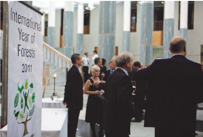
The Marble Foyer outside the Great Hall proved an impressive space to hold the pre dinner drinks