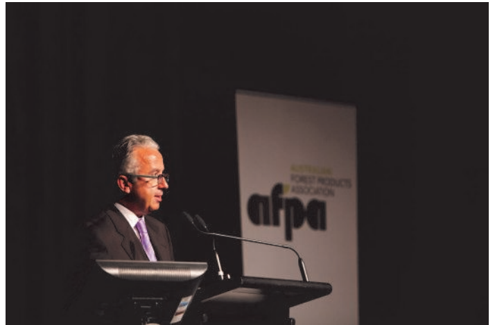
Political Commentator Glenn Milne, was MC for the evening and is pictured after the unveiling of the new AFPA logo