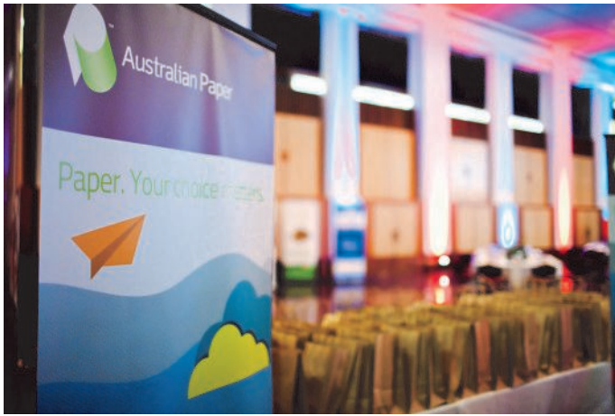
Major Sponsor Australian Paper used the dinner as an opportunity to launch their new initiative 'Creating a Tonne of Value'